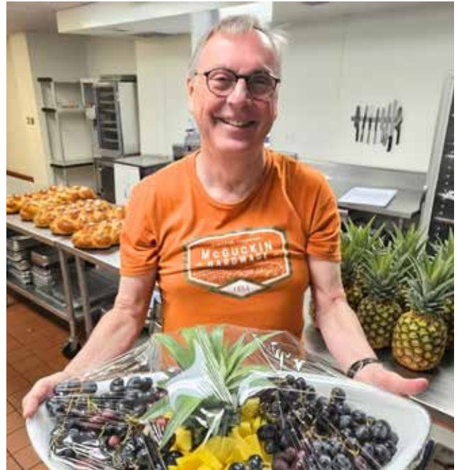
Men's Club Shabbat Dinner

Looking ahead, we're gearing up for our summer Blood Drive and our always-anticipated Steak & Scotch kickoff event at the end of