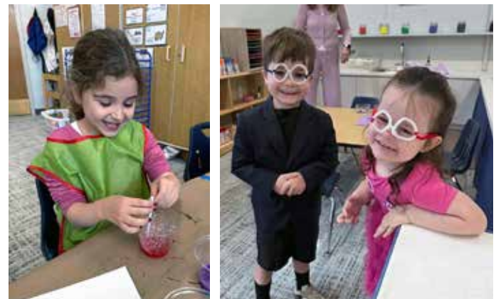
Special moments from another wonderful day in Preschool.