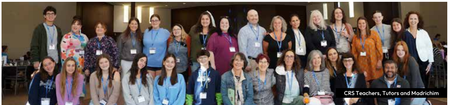
CRS Teachers, Tutors and Madrichim

We are deeply grateful for the dedication, creativity, and heart our educators bring to CRS. Because of them, our students don't just learn Judaism, they live it, feel it, and carry it forward. Todah rabbah for an incredible year of learning!