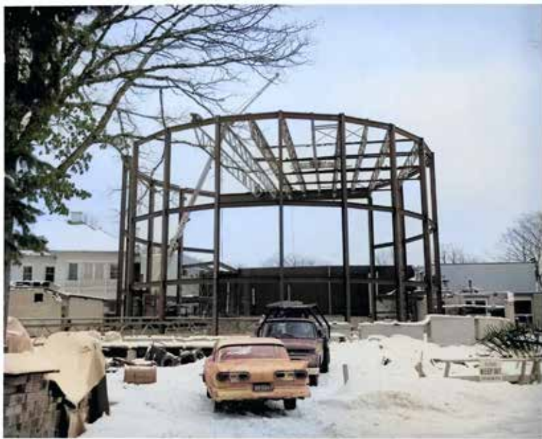
Sanctuary under construction in late 1961