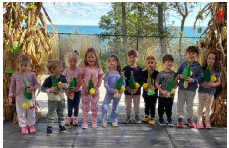
Students participating in a Sukkot celebration.