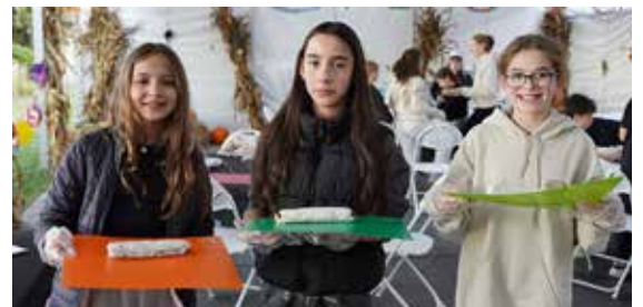
Sushi in the Sukkah