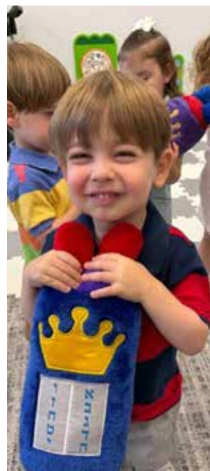
Snapshots from the classroom.