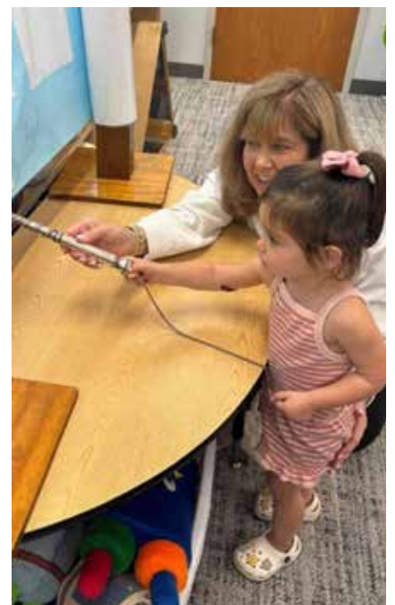
Learning and growing together at Beth El.