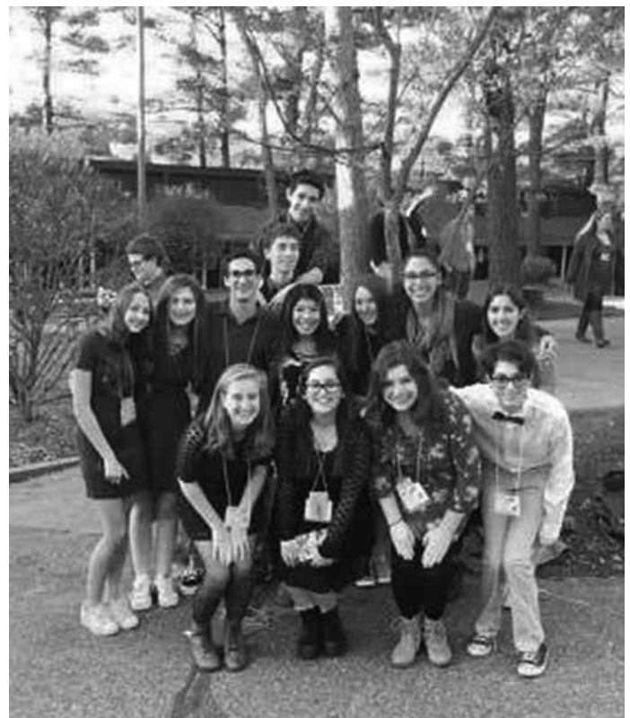
BEANS USY at CHUSYfest