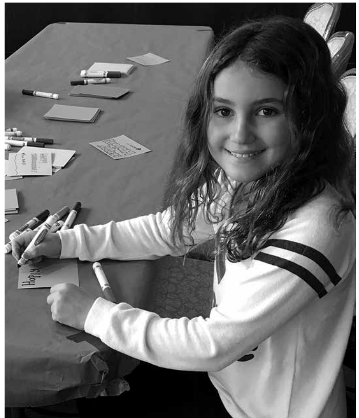
M&M Club participating in the Thanksgiving Mitzvah Project